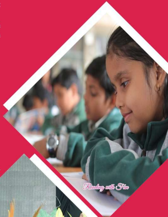
Reading with Fun