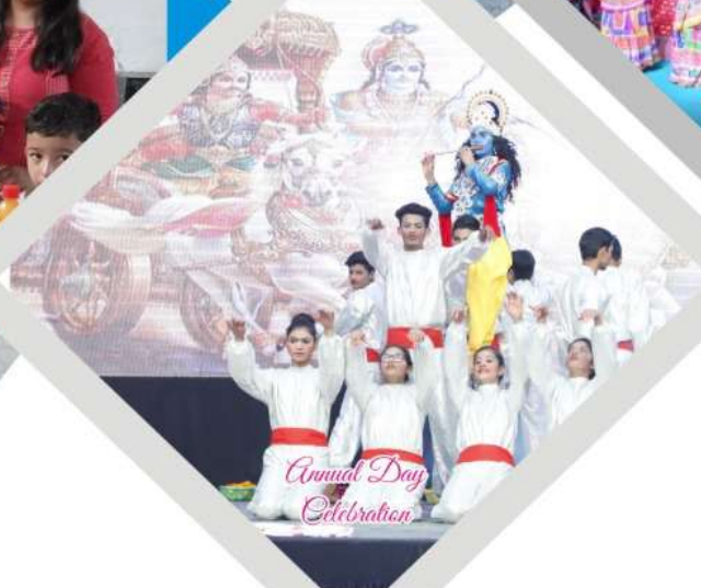
Annual Day Celebration