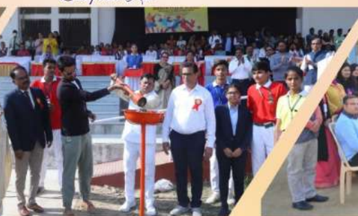
Sports Day Celebration