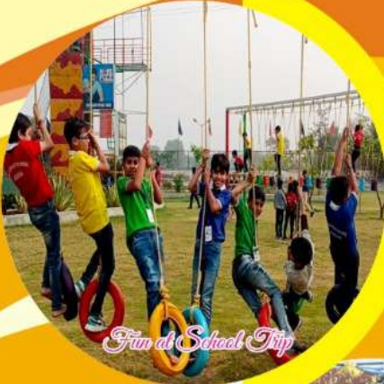
Fun at School Trip

(Under the aegis of Shri Adinath Jain Shikshan Sansthan)