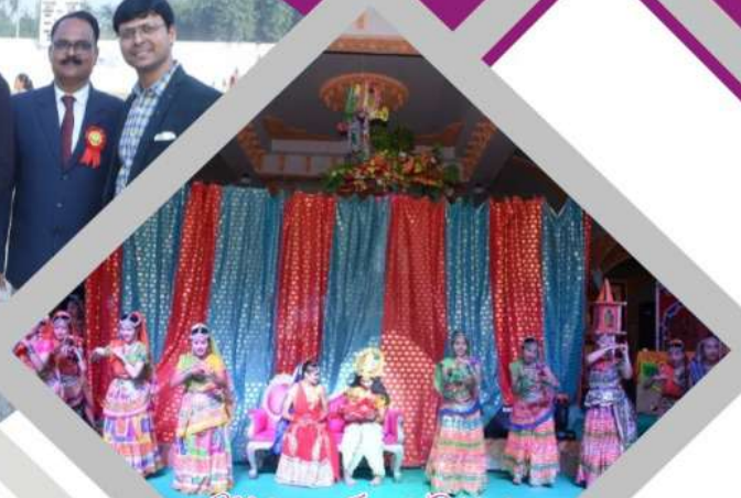
Mahaveer Jayanti Celebration