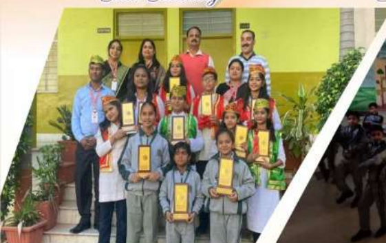
Inter School Qawwali Winners