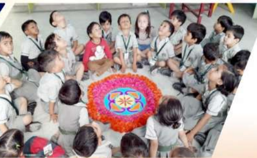
Creating an Imaginative World