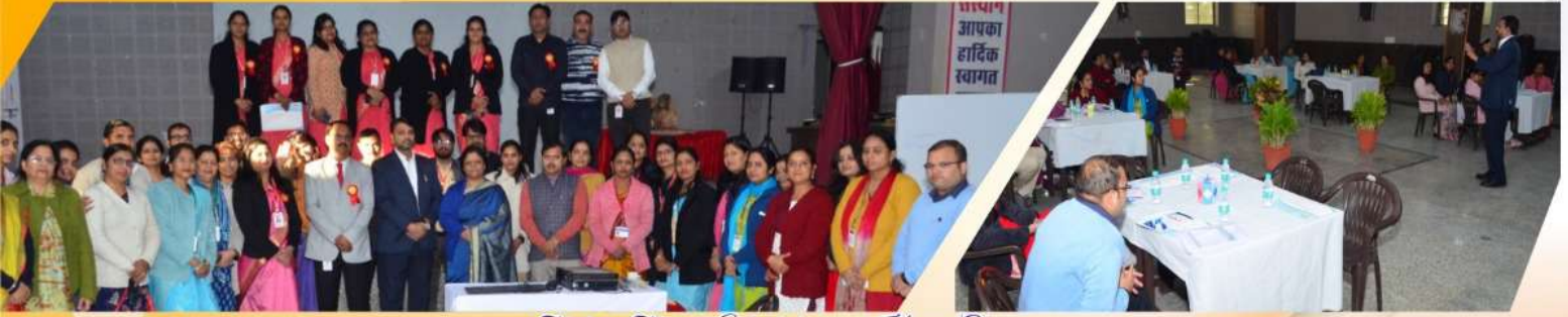
Teachers Training Workshop on Happy Classroom