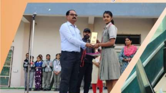
Felicitation of National Kho-Kho Player