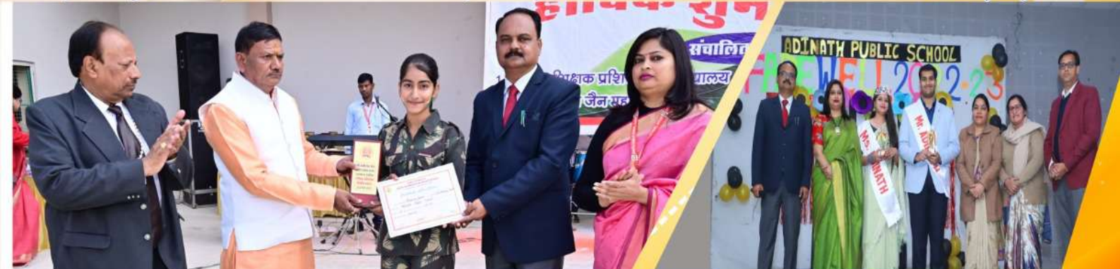
Felicitation of Board Toppers