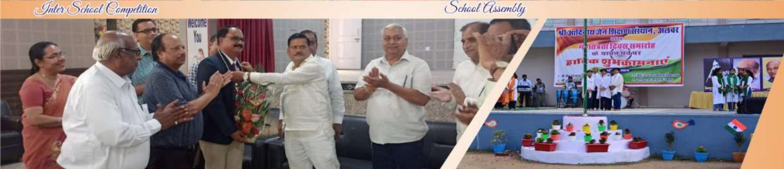
Welcoming of New Principal